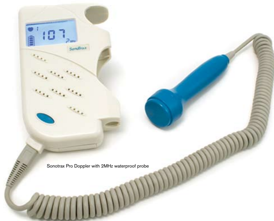
Sonotrax Pro Doppler with 2MHz waterproof probe

ST0001 Sonotrax STD £139.00 Sonotrax Standard Doppler with 2MHz probe