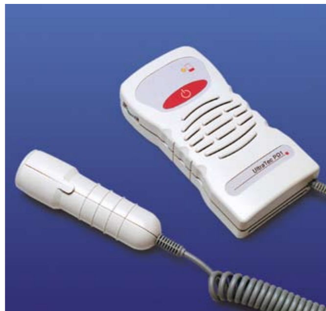
ULTRATEC PD1 £159.00 UltraTech PD1 - Foetal Pocket Doppler