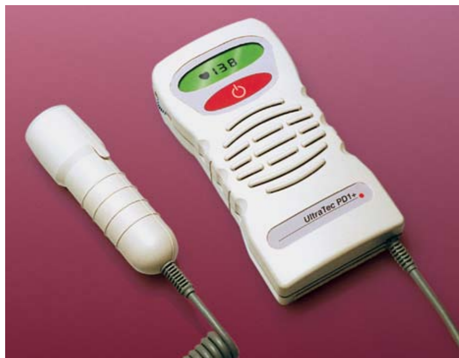
ULTRATEC PD1+ £225.00 UltraTech PD1+ Foetal Pocket Doppler with FHR display

Your local medical supplier is just a phone call away. See cover for full details Prices shown are exclusive of VAT and delivery