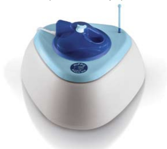
120.50.000 Hippo Humidifier £54.00