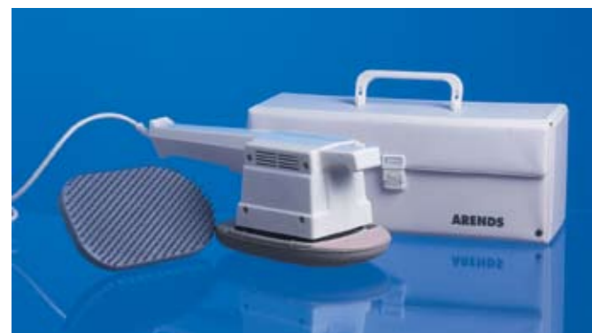
100.10.000 AW Medex large surface area massager £175.00