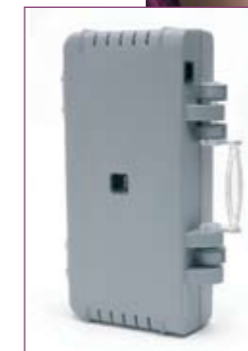
Brite-Box Brite-Box Sun Stimulator 410D-Lux £199.00