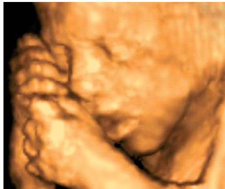
Fetal face and hands, 25 weeks