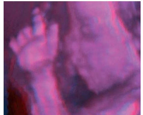
Stereoscopic image, 24 weeks